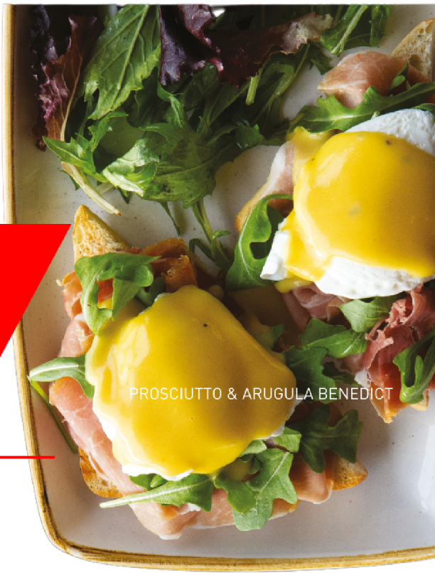
PROSCIUTTO & ARUGULA BENEDICT

Scrambled Eggs, Pancetta, Roasted Peppers, Parmesan Cheese, Spicy Aioli, Soft Roll, Brunch Potatoes, Fruit.